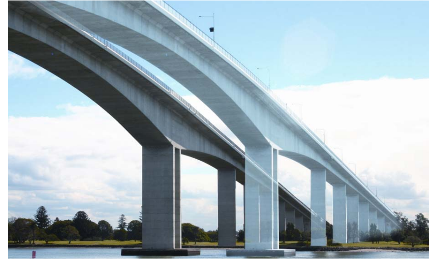
The Gateway Arterial project features a major tolled crossing of the Brisbane River with feeder roads to the north and south comprising a total of 20km of expressway.

West Australia Main Roads (WAMR) has embraced the concept of using DRBs. The commissioner was previously with WA Water and was largely responsible for inclusion of DRBs in the two major dam contracts constructed by WA Water and referred to under Australian experience pre DRBA. As yet no WAMR contracts have been awarded with a DRB included. In addition, the WA group are working on several possible opportunities for DRBs in the oil and gas area.